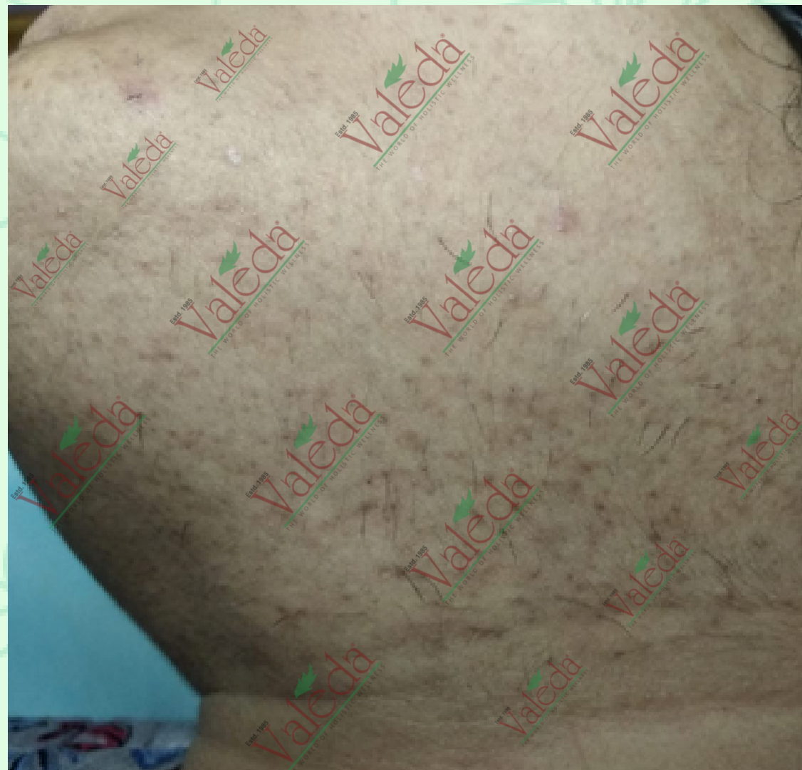
Before Treatment Day-137 at Valeda