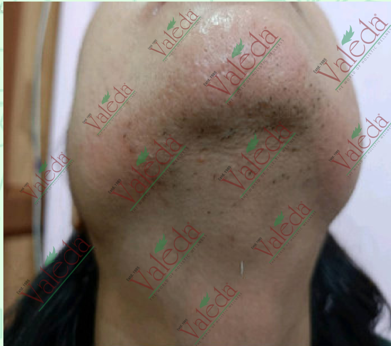
Before Treatment - Day-21